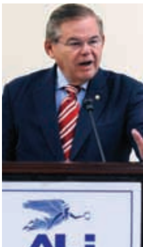
Senate Foreign Relations Chair Sen. Menendez.

AHI observed the 39th anniversary of Turkey's illegal invasion of the Republic of Cyprus by hosting a congressional briefing and forum to discuss the current state of affairs on the island at the Rayburn House Office Building on Capitol Hill, July 25, 2013. The briefing's forum allowed members of Congress on both sides of the aisle to engage in a candid discussion about how issues affecting Cyprus can be advanced on Capitol Hill and within federal agencies, including its 39-year division and its energy findings.