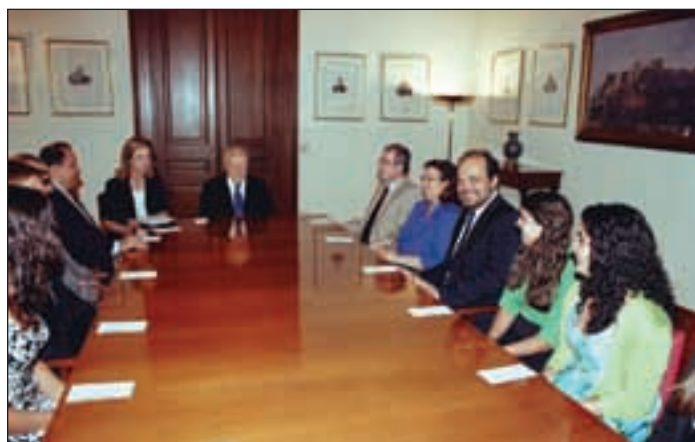
Discussion with President Karolos Papoulias.

The program is open to Greek American and Cypriot American college students in good academic standing who are studying political science, international relations, history, and/or foreign affairs.