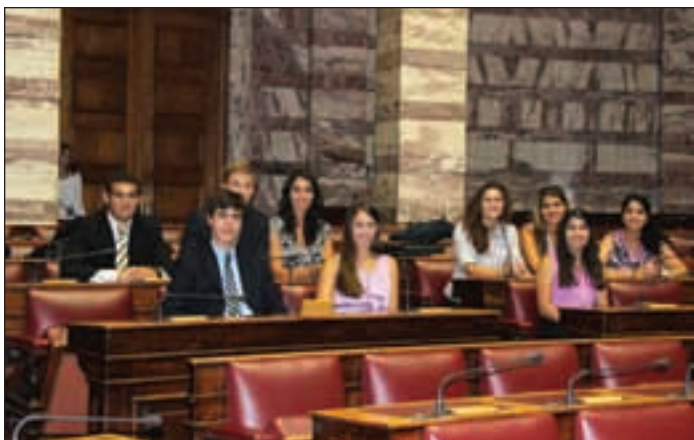
Students tour the Hellenic Parliament building.