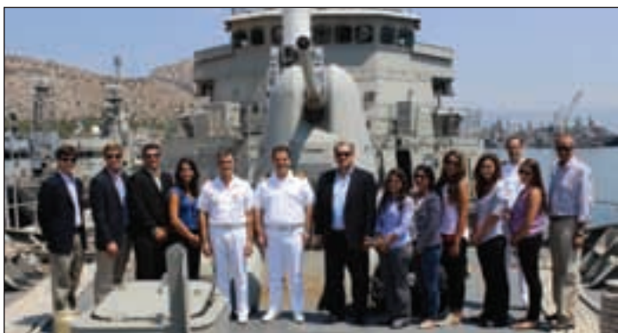
Students aboard the HS Salamis frigate.