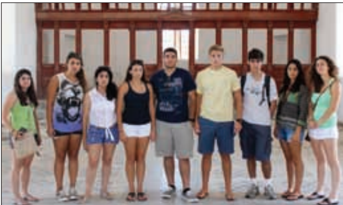
Students in an abandon and desecrated Greek Orthodox church in Turkish-occupied Cyprus.

of both countries. In Cyprus, the group visited the illegal Turkish-occupied area.