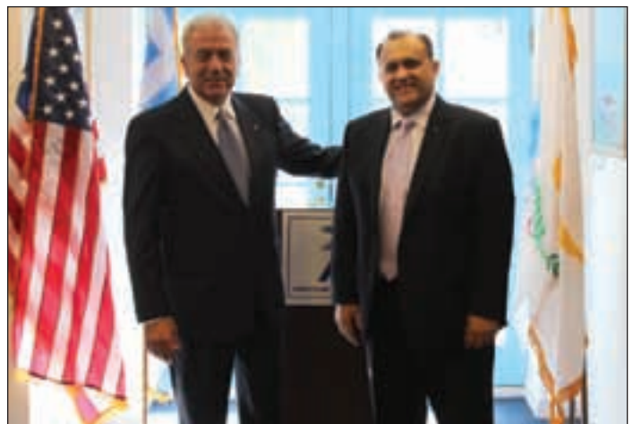
Dimitris Avramopoulos, Minister of National Defense of Greece with Nick Larigakis.

Greece's minister of Defense, Dimitris Avramopoulos, visited AHI's Hellenic House on July 30, 2013. "We were honored to welcome Defense Minister Avramopoulos to Hellenic House," AHI President Nick Larigakis said. "We discussed the purpose of the minister's current visit to Washington and its importance to relations between the United States and Greece."