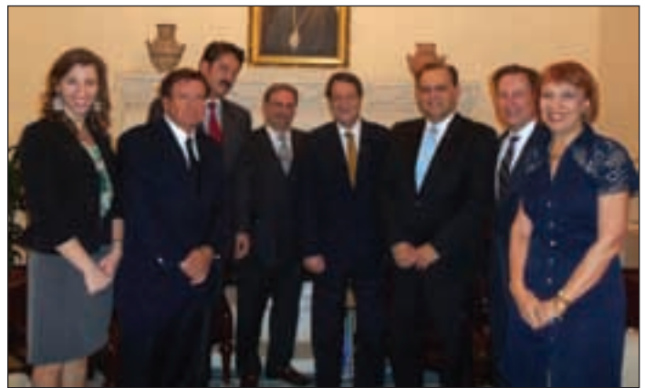
AHI delegation with President Nicos Anastasiades.

The AHI delegation received multiple briefings from Cypriot and American officials on the potential to resume direct talks for a Cyprus settlement under UN auspices, Cyprus’ efforts to explore for hydrocarbon reserves in its exclusive economic zone (EEZ), and the impact of Cyprus’ banking crisis. All throughout the delegation’s meetings in Cyprus, AHI was commended for its past advocacy and current steadfast efforts to keep the Cyprus issue highly visible with key policymakers in the Obama administration and in the U.S. Congress.