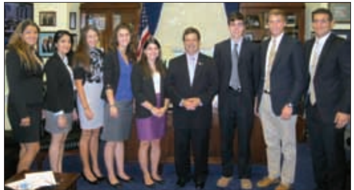
Briefing on Capitol Hill with Congressman Gus Bilirakis, co-chair of the Hellenic Caucus.

The American Hellenic Institute Foundation (AHIF) Foreign Policy Trip to Greece and Cyprus completed its fifth year as nine students from across the United States participated in the two-week program held June 19 to July 6, 2013.