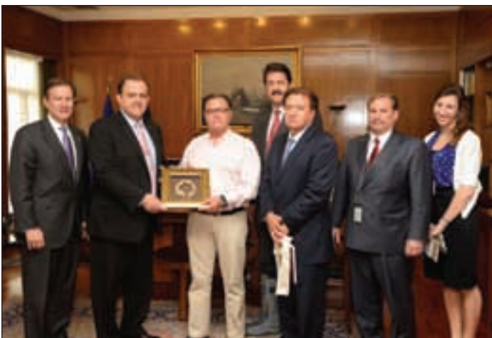
AHI delegation with then Minister of Defense Panos Panagiotopoulos.