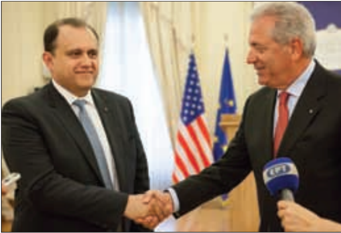
Nick Larigakis and then Foreign Minister Avramopoulos providing a joint statement following the briefing with the AHI delegation.